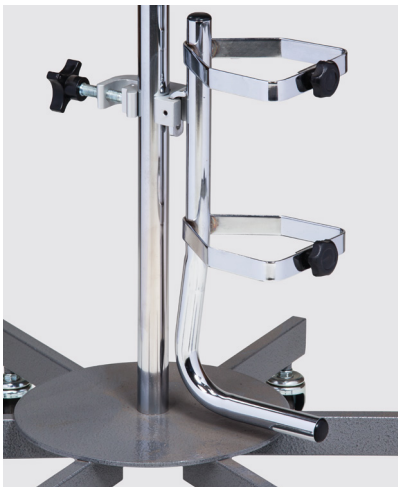
IV-44 Oxygen Cylinder Holder