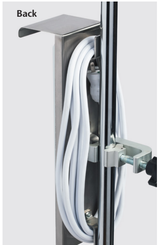
IV-50 Pole Outlet Strip