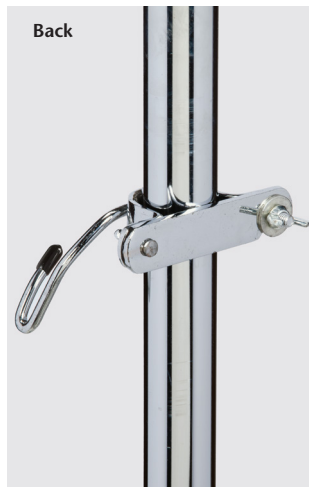
IV-56 Drainage Hook