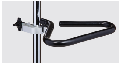
IV-43 Steering Handle