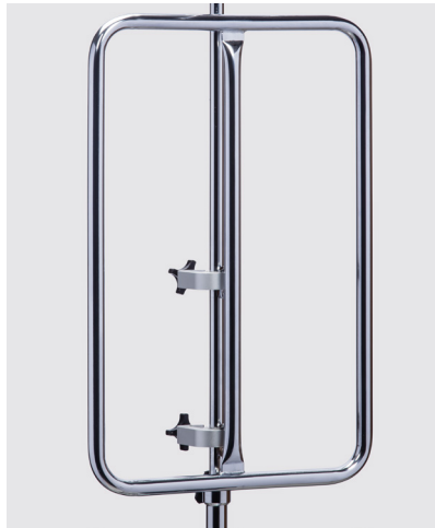
IV-42 Infusion Pump Frame