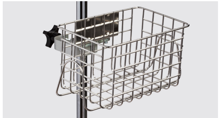
Heavy Duty Stainless Steel Wire Basket IV-51S – 14" x 8" x 8.5" IV-52S – 12" x 6" x 6.5"