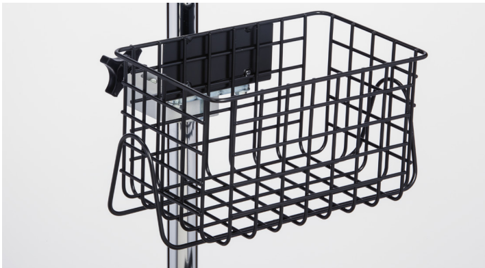
Heavy Duty Black Epoxy Wire Basket IV-51B – 14" x 8" x 8.5" IV-52B – 12" x 6" x 6.5"