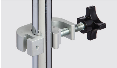
IV-41 Universal Clamp