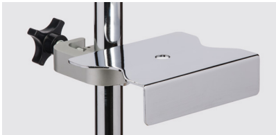
IV-46 Pump Tray Support