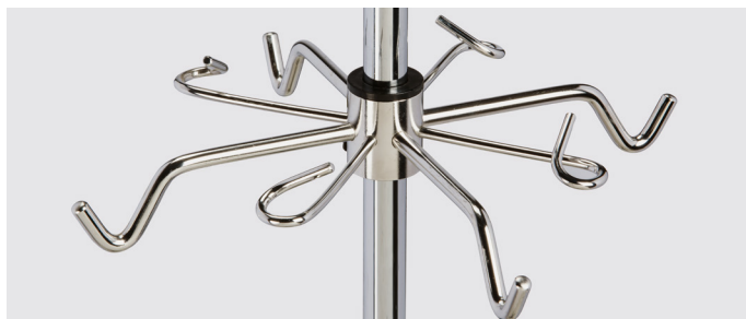
IV-55 Extra Hooks and Organizer Hooks