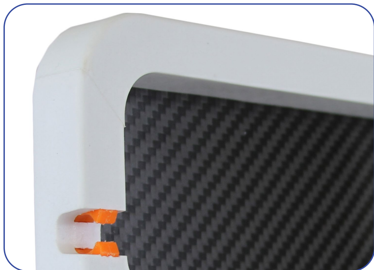
Curved Corners and Cable Management