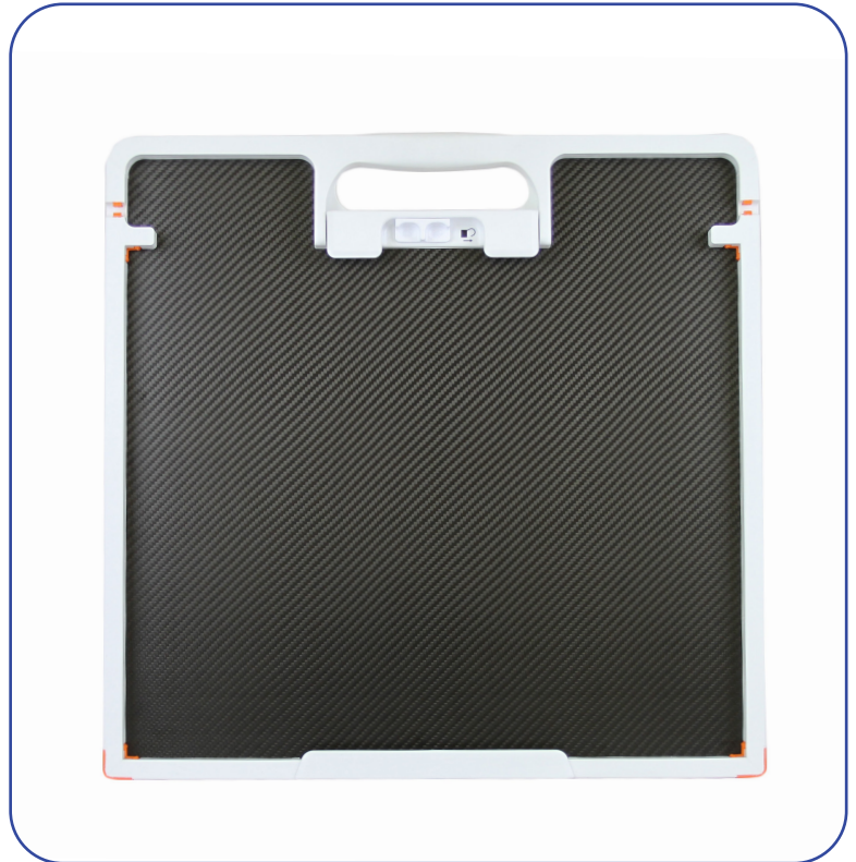
Rear Side with Twin-Lock™