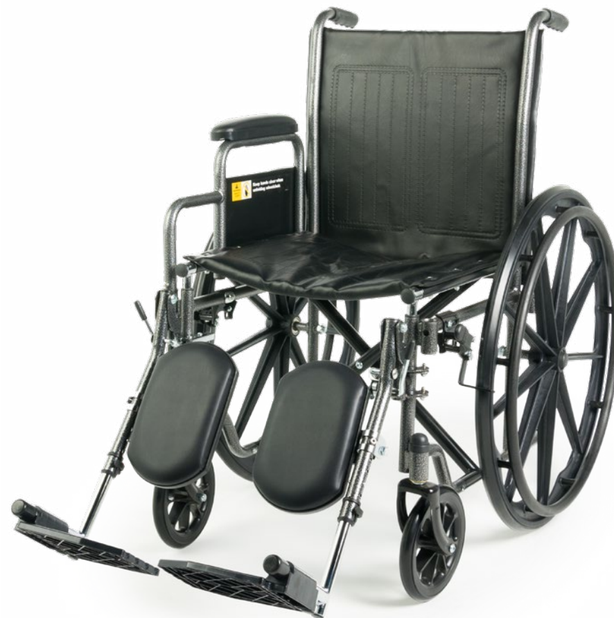
fixed-back model with detachable desk arms (shown) and elevating legrest (shown) – other configurations available